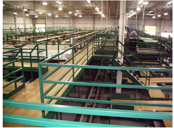
Figure 3: Walkways Covering Delivery Track

Rockwell Automation has a third-party referencing program that allows them provide a complete solution for industrial applications called the Encompass™ program. Many Encompass wireless vendors were tested for this application but the ESTeem 195Eg, 2.4 GHz wireless Ethernet modem was found to provide the best coverage area with the highest data rate. The ESTeem 195Eg has a 1 Watt output power and 54 Mbps throughput that worked well for the trolley application's difficult RF environment.