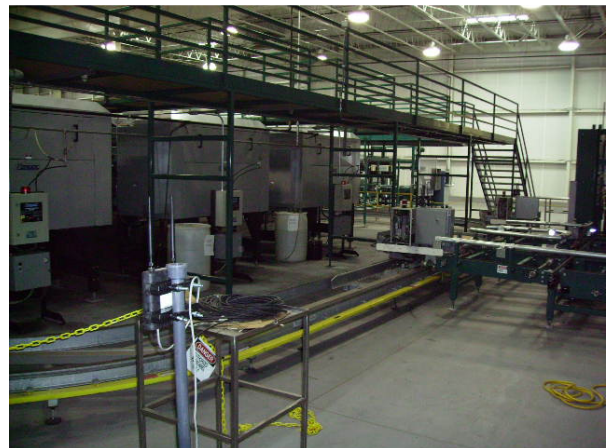
Figure 2: Automated Bin Delivery Track

The only way to control this complex network is to maintain continuous contact from the Central PLC to each one of the smart