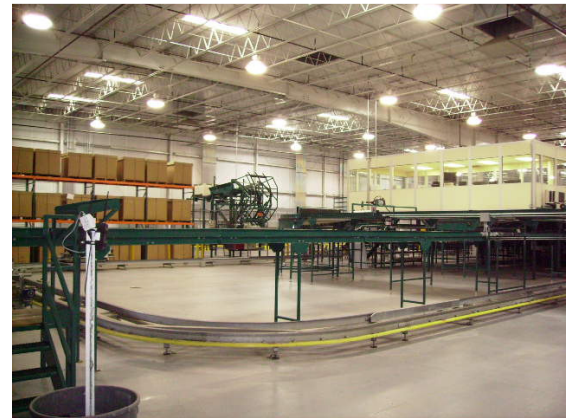
Figure 4: ESTeem Repeater Location

ESTeem Wireless Modems was requested to help design the wireless network for the trolley system. After the ESTeem hardware was tested and selected for this application, an on-site radio survey was completed to determine the best location for the Master PLC's ESTeem and any required repeater sites. Through this on-site analysis of the system and signal strength testing, it was determined that a central 195Eg at the master location and four (4) repeater sites on the corners of the trolley pathway (Figure 4) would allow overlapping coverage to all areas of operation. The overlapping coverage of the repeater sites would provides redundancy in the network. If one of the repeater sites were ever to loose power the other repeater sites could still provide radio coverage to that area. All areas throughout the difficult RF pathways were tested to ensure constant radio coverage with the Central PLC. Each phase of the radio integration was an excellent example of how to design a reliable wireless network.