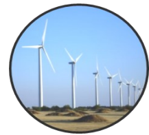
Power & Energy