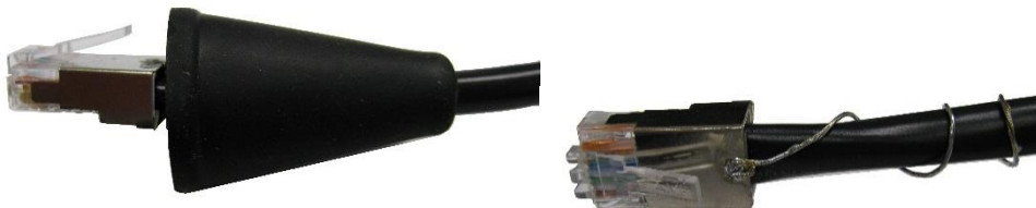
Radio Side Connector Boot Detail