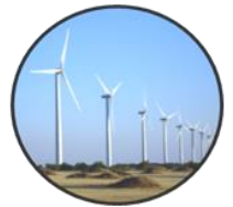
Power & Energy